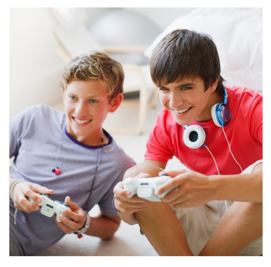
Strengths in visual skills means they may get a lot of enjoyment from succeeding in playing computer games and using visual aids at school.

In their studies they can compensate by using their strong visual skills, and teachers may find that giving them information visually (e.g., lists with diagrams or pictures) helps them to focus in class. Where they need to learn abstract information, it should be broken down into small chunks and learned over several occasions rather than just one. At all times they need to be helped to understand the meaning of what they are learning and creating visual models, charts or diagrams, using colour and shape will help them to absorb information