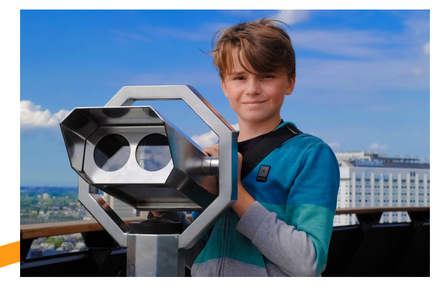
Make sure to have photos that match your stories well too. The key to compelling newsletters is a fantastic combination of awesome text and brilliant pictures that complement the story you want to get across.

it is very important to look for and cultivate the genuine talents each child has. Finding an activity at which he or she can excel is an effective way of improving a student's selfesteem. Reassurance rarely helps, as the student is only too well aware of his or her difficulties. Genuine achievement promotes selfesteem, which in turn helps the child to grow and further display his or her natural talents.