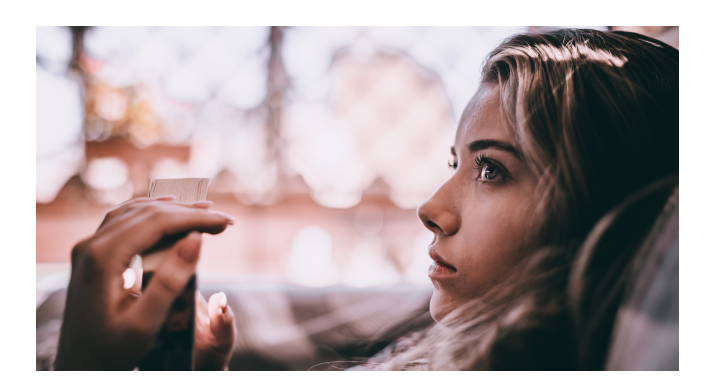
Many children struggle with reading because of basic problems encoding sound in the brain.

They may be seen as lazy, or worse, as unintelligent, when they really have a specific learning disability. As the following stories show, failure to identify the real problem may lead a child to disengage from school.