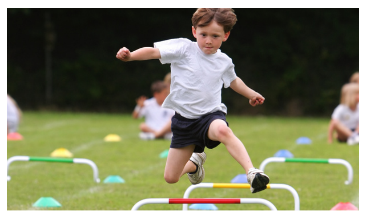
Children with learning difficulties may also have issues with low muscle tone and clumsiness, resulting in greater injuries if they play sport.